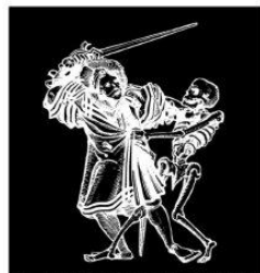
The House of the Devil from 1896 was the first horror movie—but it wasn't the last.

And then there's the movies. Movies about ghosts and the paranormal have been around since the earliest days, but these days we're flooded with them. Just consider the popularity of films like Paranormal Activity , Insidious , and their three thousand sequels.